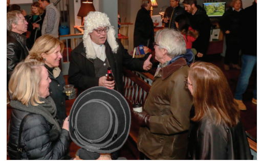
Visitors enjoyed refreshments and candy canes at the 1787 Court House during Fezziwigs at Shine Bright Bedford weekend.