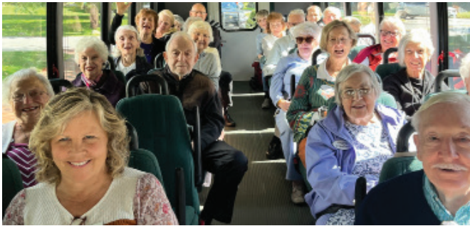
Meadow Ridge residents "bus toured" Bedford Village and learned about Bedford's history during their field trip.

Our many Educational Programs include Footsteps in the Past for students, Guided Walking Tours of Historic Bedford Village for the community, Bus Tours for Seniors , our new Great Bedford History Hunt , History Matters talks and more.