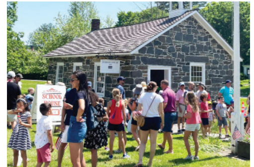
Families visited the 1829 School House for a lesson with the School Marm, participated in Colonial Games on the Green and enjoyed ice cream compliments of our Board.