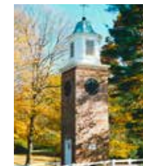
Preserving since 1985