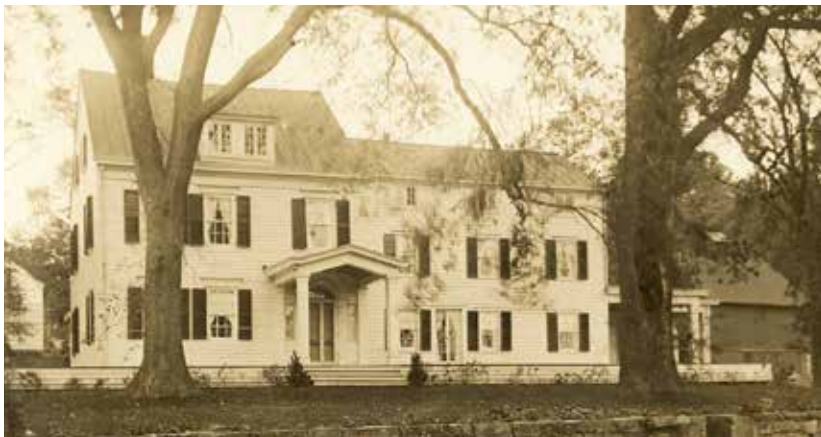
The Bedford Boys School on Stone Hill Road