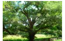
Preserving since 1977