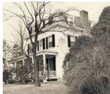
Kinklel house on Pound Ridge Road