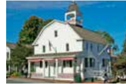
Preserving since 1965