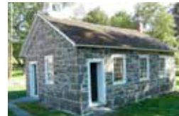
Preserving since 1917; Acquired 1975